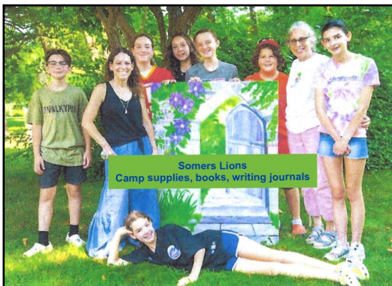
Somers Lions Camp supplies, books, writing journals