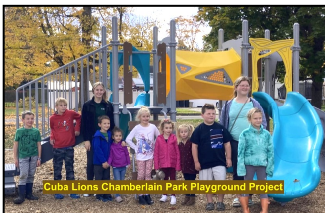
Cuba Lions Chamberlain Park Playground Project