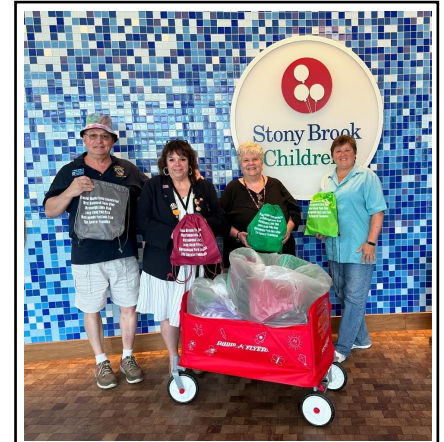
West Hempstead Lions spearheaded a $2,000 matching grant for the drive to give 50 swag bags to the children at Stony Brook Children's Hospital on Long Island.